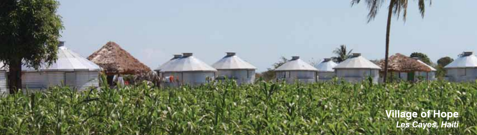
Village of Hope Les Cayes, Haiti