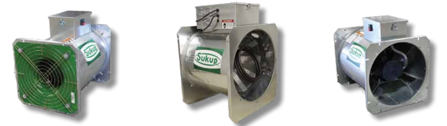
1750 RPM Centrifugal Fan Dimensions - centimeters