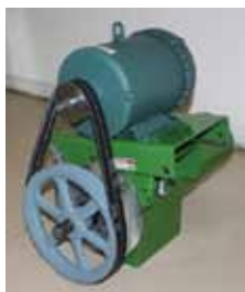
Single Motor Horizontal Drive