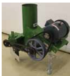
Single Motor Vertical Drive