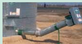
10" incline auger shown with optional support leg.

Sukup Manufacturing Co. provides the information contained within this brochure to assist you in choosing the optimal equipment for your situation. Sukup specifications should only be used as estimates, and not as a warranty, expressed or implied, of how a particular Sukup unit will perform under your varying operating conditions. Because we are continually improving Sukup products, changes may occur that may not be reflected in the specifications.