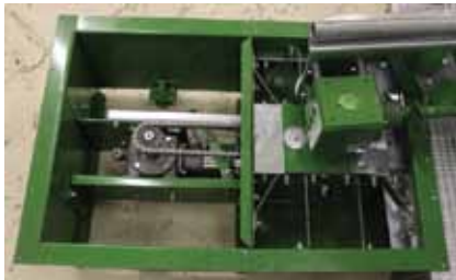
Shields removed to show detail. Keep shields in place.