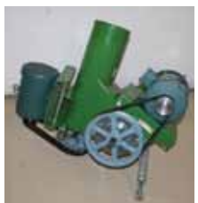
Two Motor Vertical Drive - Top or Bottom